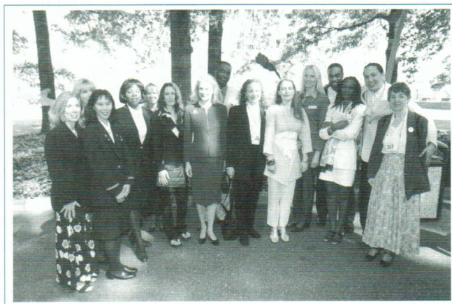
Airline Ambassadors with Mrs. Kofi Annan at the United Nations Gardens.