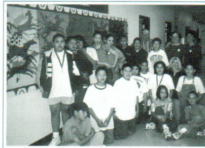
5th grade class of Little Wound Elementary on the Lakota Sioux Reservation