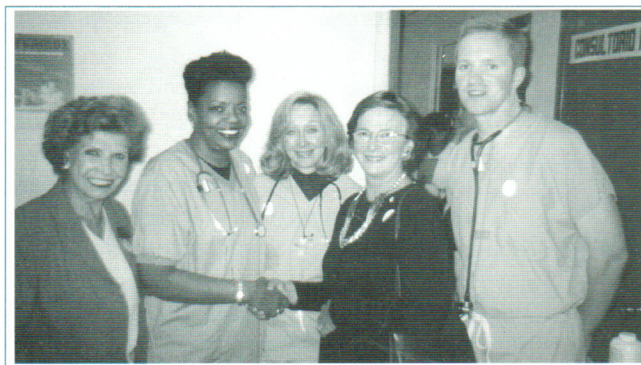
First Lady of Equador thank's Airline Ambassadors team for helping the sick in her country

22 Humanitarian Missions to 14 Countries.