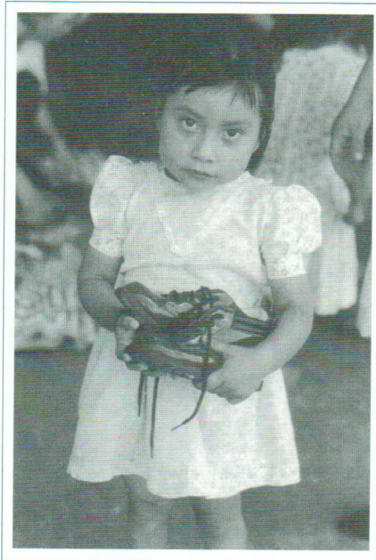
Guatemalan girl with new boots

have seen her at the airport selling Guatemalan jewelry or coffee (all proceeds go back to help the local people). Her own passion to help is infectious and she is becoming well known in Guatemala. The April issue of "Revue," a Guatemalan English magazine features her efforts.