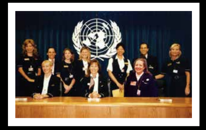
If you have questions about Airline Ambassadors or the programs and services offered, call 866.ANGEL-86 and talk to a membership representative today.

Airline Ambassadors International 550 14th Rd. South # 1014, Arlington, VA 22202